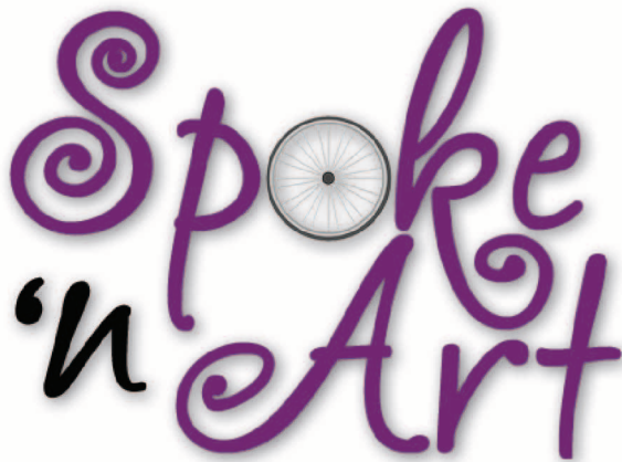
A tour via bicycle of Leawood's Public Art

Leawood Parks & Recreation 4800 Town Center Drive Leawood, Kansas 66211